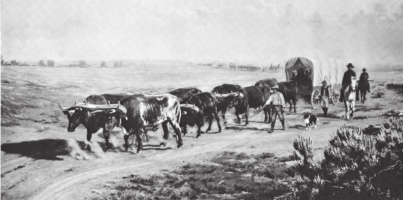
Title Insurance and Trust Company, Los Angeles, California