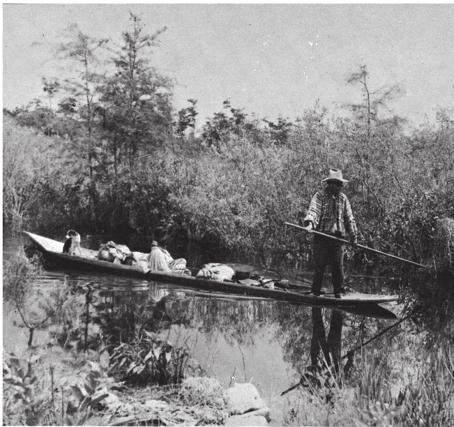
Miami Chamber of Commerce