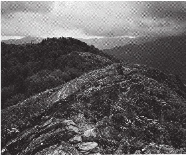
United States Department of Interior National Park Service