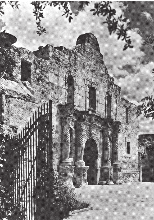
San Antonio Chamber of Commerce

When Santa Anna, the new President of Mexico, marched soldiers into Texas, a short but bloody war began. In all, it is claimed, 188 Texans fought and died in the Alamo, the old fort in San Antonio. Forty-six days later Santa Anna was defeated at the Battle of San Jacinto, near the eastern border, by a little army of Texans under General Sam Houston of Tennessee. Texas became a republic with a constitution permitting slavery. Sam Houston, a former governor of Tennessee, was elected the first president of the “lone star” republic. This happened in 1836 during the last year of Jackson’s Administration and the year that the Whitmans crossed the plains to Oregon.