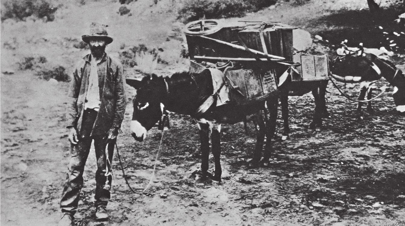
Title Insurance and Trust Company, Los Angeles