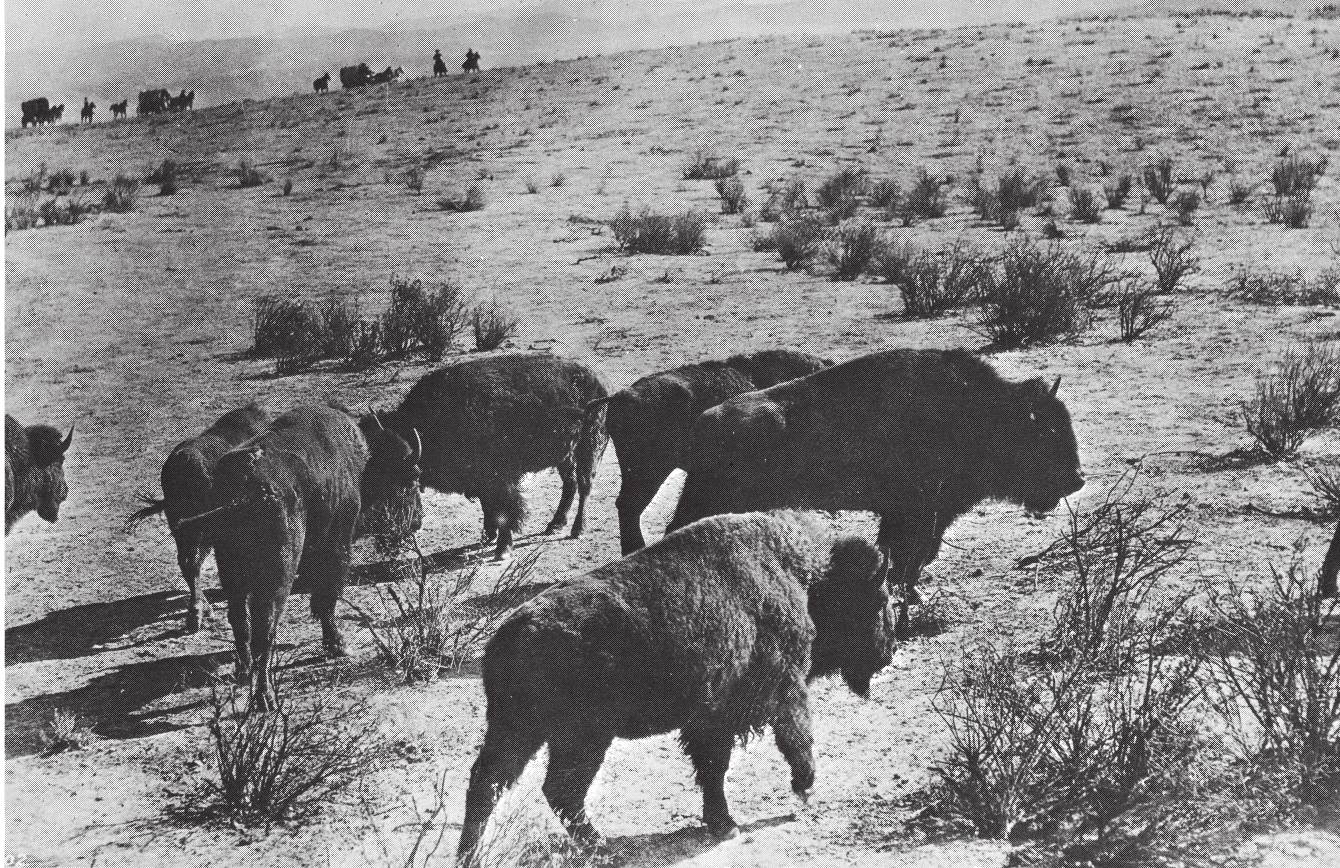
Title Insurance and Trust Company, Los Angeles, California