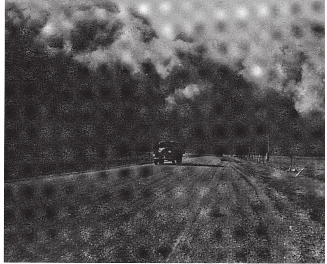
United States Department of Agriculture

The first emigrants to Oregon had told of the endless prairie without a tree in sight. If they made the same journey today, they would find lanes of trees planted for windbrakes along the fences between fields. When the sod of the prairie was first turned over, the wind did not blow away the soil because the long tough roots of the native grasses matted the dirt. Now, the plains farmer plows his wheat stubble like a "sod-buster" and leaves part of the straw above the ground to hold the soil when the March wind blows. Instead of plowing in straight rows, he writes the letter "S" in furrows up and down the field, planting his crops in strips at right angles to the wind. In dry areas on the northern plains some farmers use a