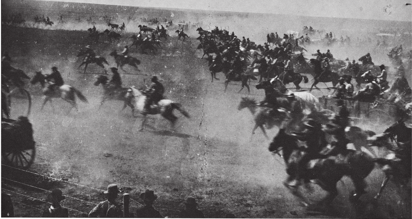
Oklahoma Historical Society