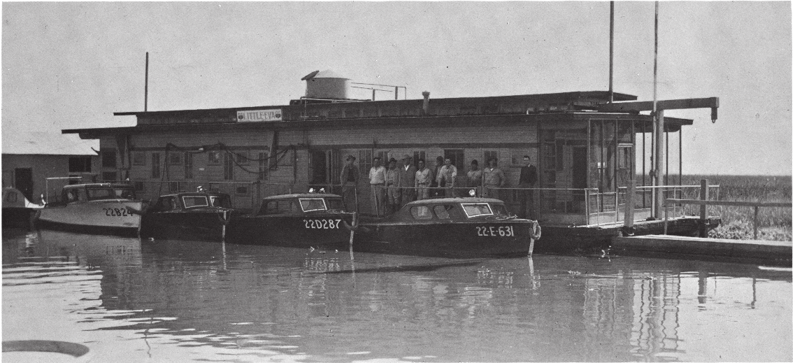
Union Oil Company