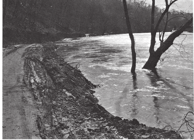
Tennessee Valley Authority