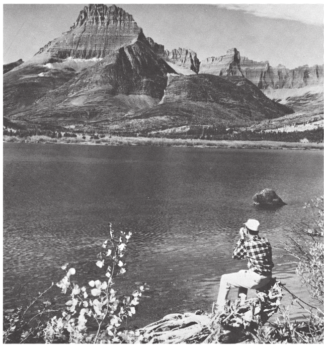
Montana Highway Commission

On the chilly evening of September 19th, the explorers made their campfire at the junction of the Firehole and Gibbon Rivers. The time was nearing for their return. They began to wonder what people would say when they told of seeing pink and lavender mud seething in holes in the ground; jets of steam spouting from pits and crevices; petrified wood buried for ages under lava and ashes belched from craters of volcanoes long extinct; a river tumbling over a waterfall 310 feet high; and a canyon twenty miles long and over a thousand feet deep, with tinted walls of volcanic rock. Would they too, be ridiculed?