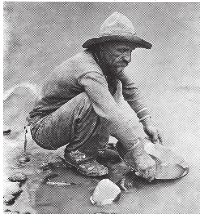
Title Insurance and Trust Company, Los Angeles