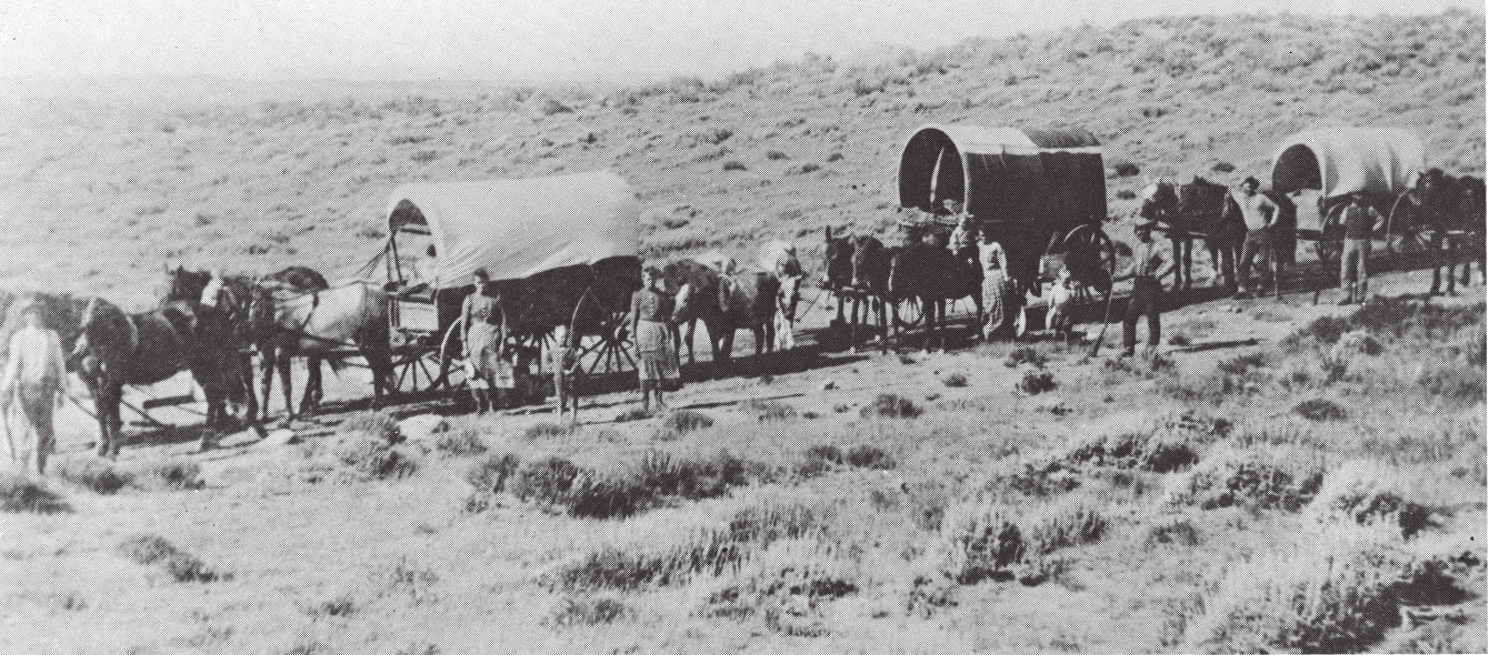
Union Pacific Railroad