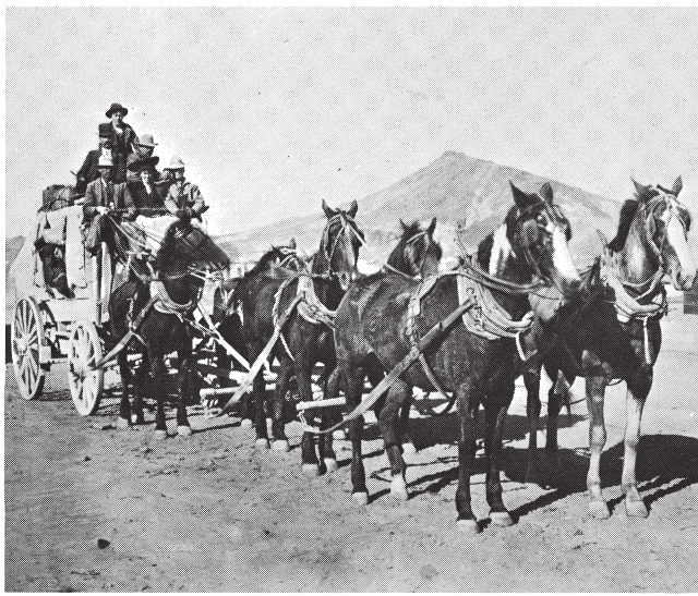
Title Insurance and Trust Company, Los Angeles