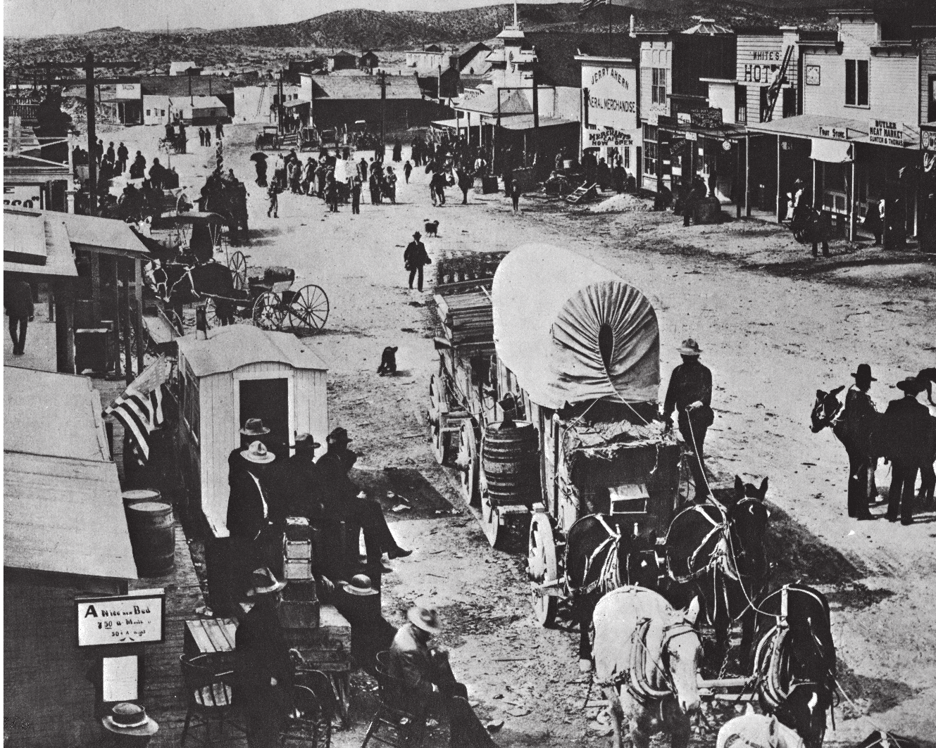
Title Insurance and Trust Company, Los Angeles