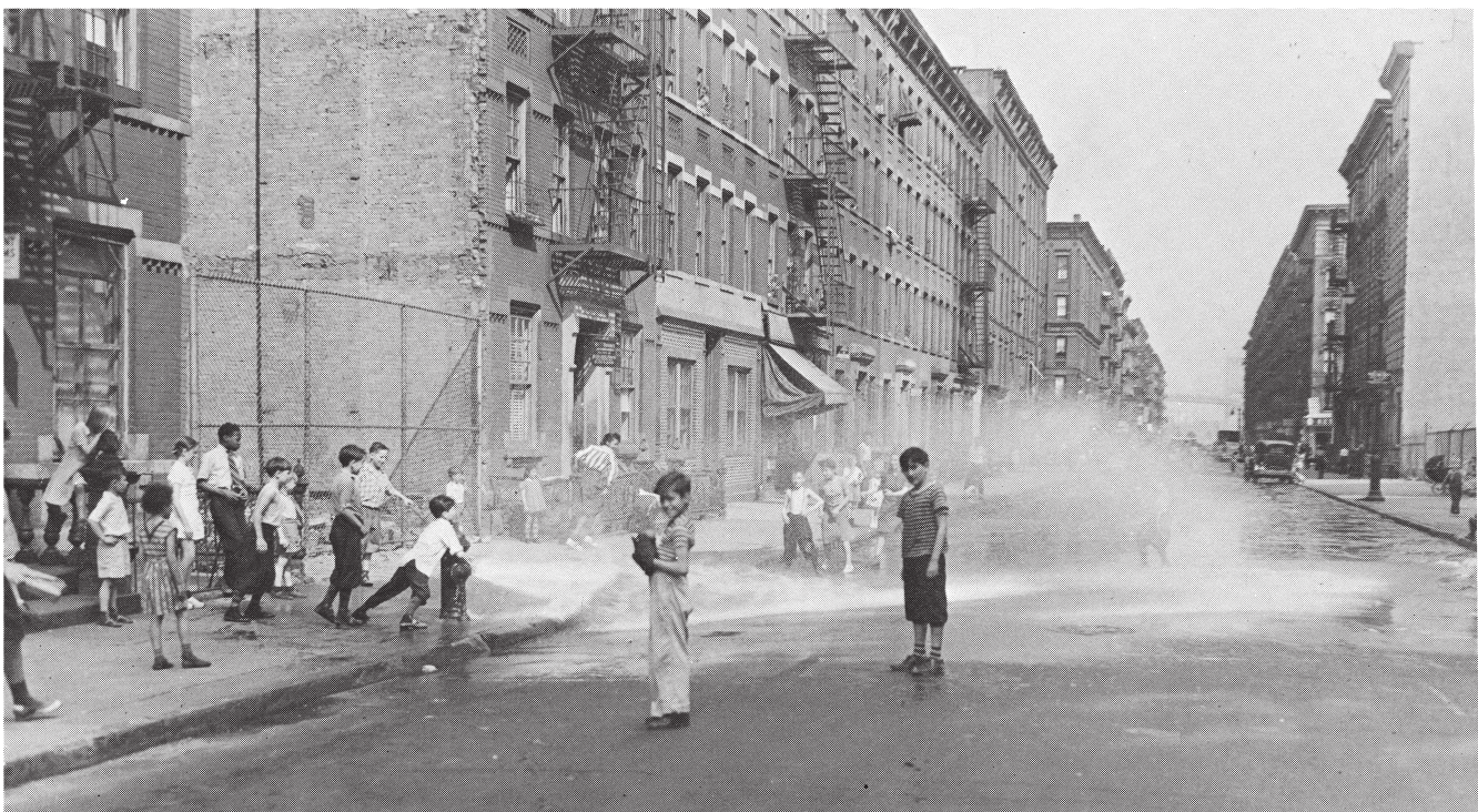
New York City Housing Authority