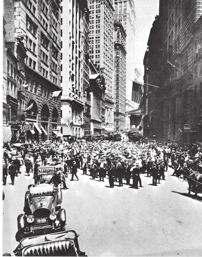
The American Stock Exchange

At the same time, events in Russia were affecting the progress of the war. On the seventh of November of that year, the Bolsheviks had gained control of the Russian government after a bloody uprising costing many lives. Lenin, the new leader in power, wanted peace at any price to clear the way for extending his