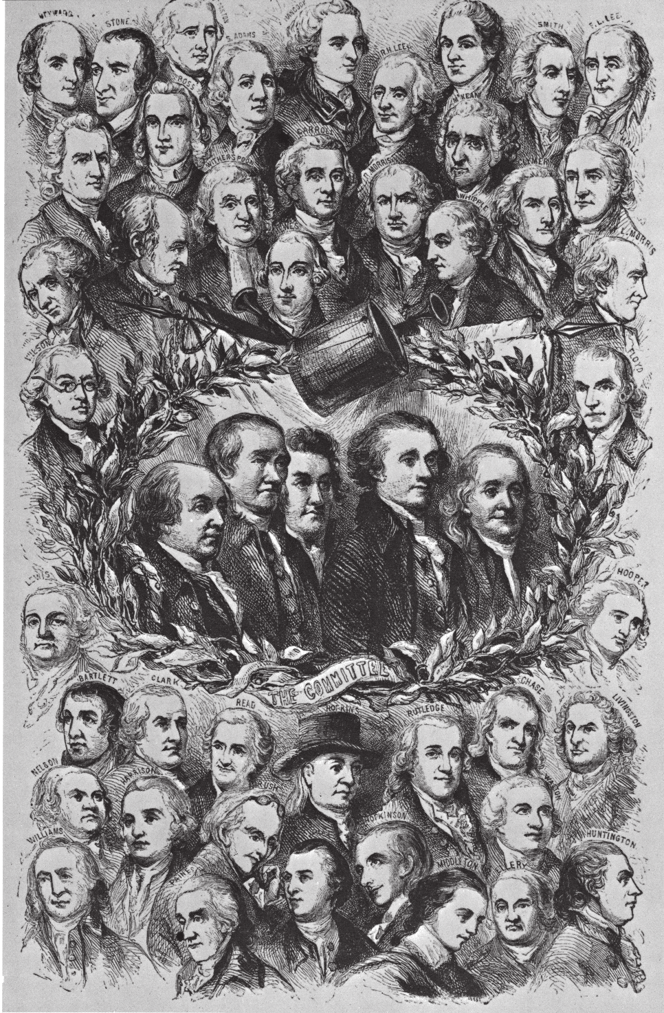
MEMBERS OF THE CONTINENTAL CONGRESS WHO APPROVED THE DECLARATION OF INDEPENDENCE