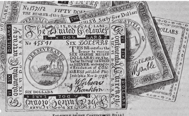
FAC-SIMILE OF THE CONTINENTAL BILLS. 1