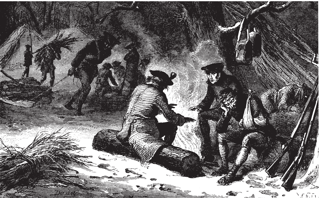
Benson J. Lossing